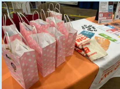
Table at Project Share

We partnered with Project Share to expand Pad Pantry in our community!