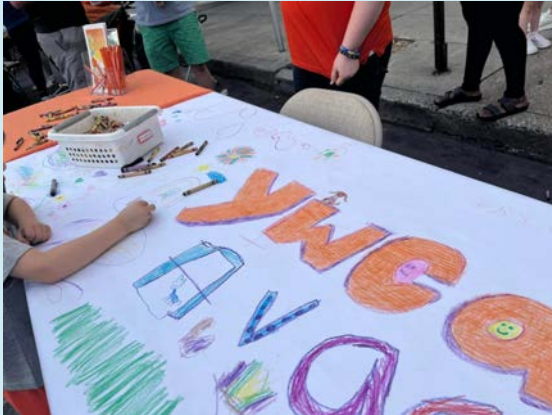
YWCA Carlisle and Cumberland County table at the Downtown Mile.